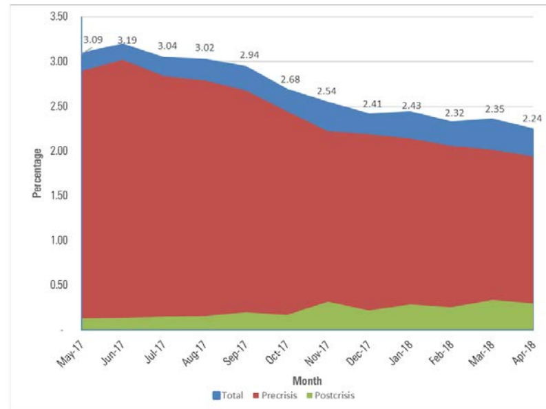
Exhibit 2 Monthly Delinquency Rate

Driven by the liquidation activity of specially serviced legacy loans, delinquency rates should remain low. The delinquency rate hit a postcrisis low of 2.24% in April and is down 90 basis points from a year ago. With steady new issuance volume pushing the outstanding balance of CMBS loans higher and special servicers actively resolving or liquidating assets, we believe the delinquency rate will hold below 2.5% for the rest of the year. Delinquencies from deals issued from 2010 through 2018 represent just 0.3% of the CMBS universe, while delinquent precrisis loans account for 1.9%.